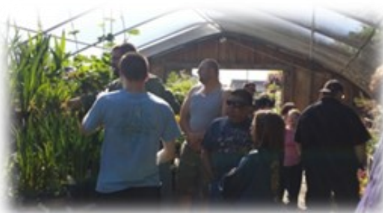
Franz Witte Nursery

Babby Farms: clients witnessed the “ FUNNIEST ” moments at Babby Farms petting zoo with seeing an array of farm animals they could pet, feed, and experience close up, unlike any other place. Little did they know that they were learning about different types of animals and their habitats.