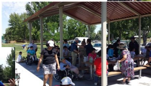
July 3rd BBQ